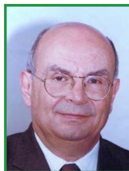
Dr Nabil Kronfol President Lebanese Healthcare Management Association

chronic and complex and older people can develop complex health states (frailty, increased risk of falls). If not properly managed, these conditions can lead to polypharmacy, hospitalization and death. Providing care for older people is also increasingly complex with the involvement of many types of health workers 4 . Health-care services to the older population will need to serve people with a high and stable level of intrinsic capacity, those with a declining capacity and those whose capacity has deteriorated and thus require additional support.