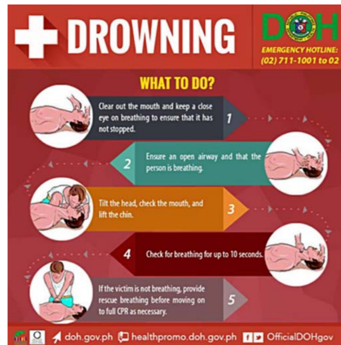
Fig.1. First Aid in Drowning

NGOs can also work on post drowning rescue programs. In other words, spreading knowledge and practice on first aid intervention when encountering a drowning victim can save lives. As mentioned earlier, drowning is quick so the earlier the intervention and the rescue, the faster and easier is the recovery (Fig.1)