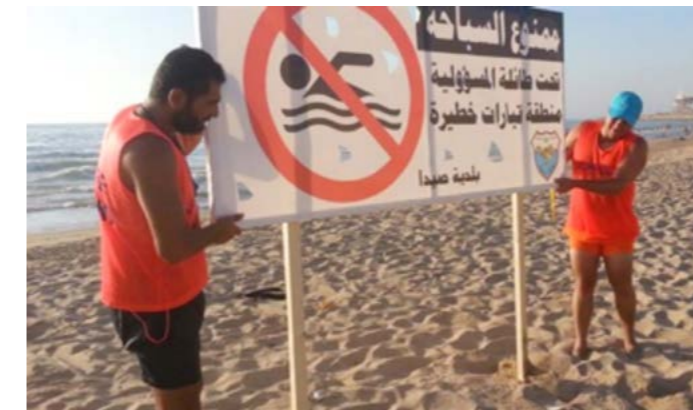
Fig.2. LASIP reminding swimmers about the decision of Sidon's municipality.

In Lebanon, where drowning is a challenging public