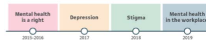
Figure 2 – National awareness campaigns’ themes

In the area of prevention and promotion in mental health, WHO has been supporting the national educational campaigns that aim at increasing awareness around a mental health issue (figure 2). WHO also supports the development of advocacy and educational materials around mental health (figure 3).