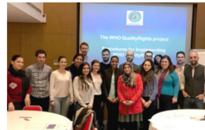
Figure 1 - Training on WHO Quality Rights

over 2,000 healthcare staff who are not specialized in mental health on recognizing and managing priority conditions using the WHO mental health Gap Action Program intervention guide 4 . WHO also supports the procurement of psychotropic medications that are in line with the WHO essential drug list. A guide was also developed to rationalize prescription 5 . In addition, emergency mental health care was addressed through training staff at emergency departments of public and private hospitals on managing psychiatric emergencies. In terms of improving quality of care, WHO has trained a national team of assessors and has facilitated the first assessment of the quality and human rights aspects in facilities providing mental health services using the WHO Quality Rights approach 6 (figure 1).